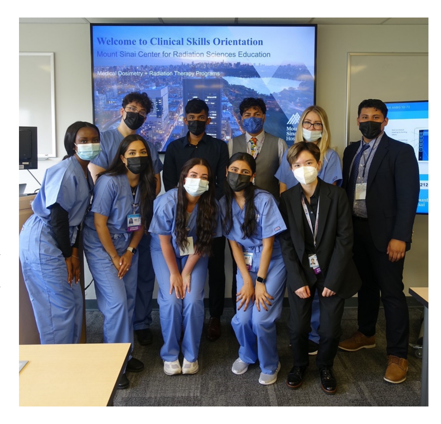
Congratulations to the medical dosimetry students who will be joining our radiation therapy students in clinic

Center for Radiation Sciences Education: Medical Dosimetry Program Transitions to Mount Sinai